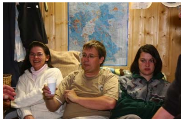
After some hours