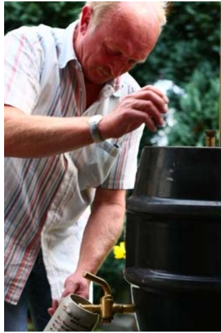
Young girls and old men (DJ2NR) are thirsty