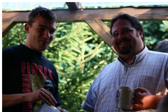
DK5NJ and DH1NHI like it more often