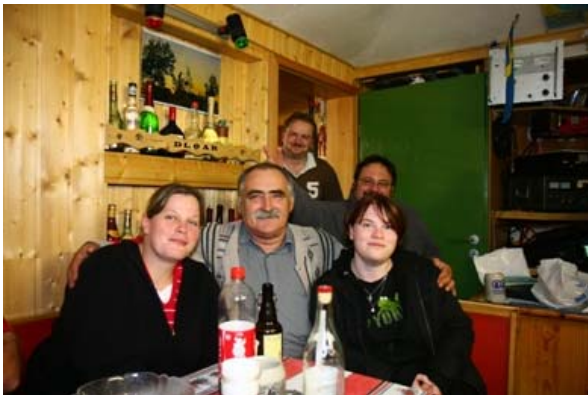
Also Reinhard likes young girls