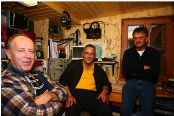
DK1FG, DF5NK, DB6NT