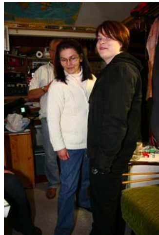
Mother and daughter