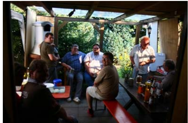
Visitors became more and more