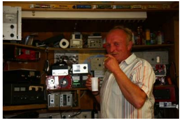
DJ2NR and radio- station