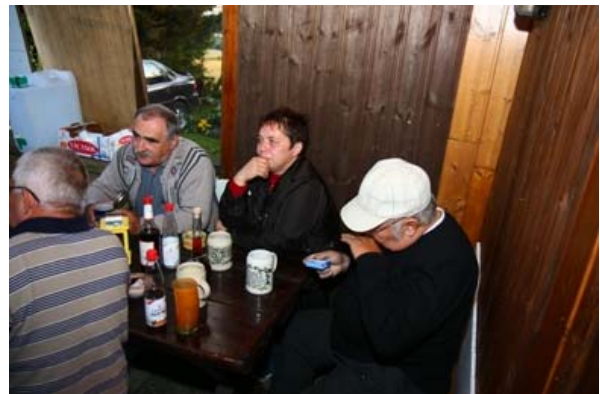
DL3NBL, DL8NBI, YI de DK1FG, DF9NE is taking some sniffing- tobacco!