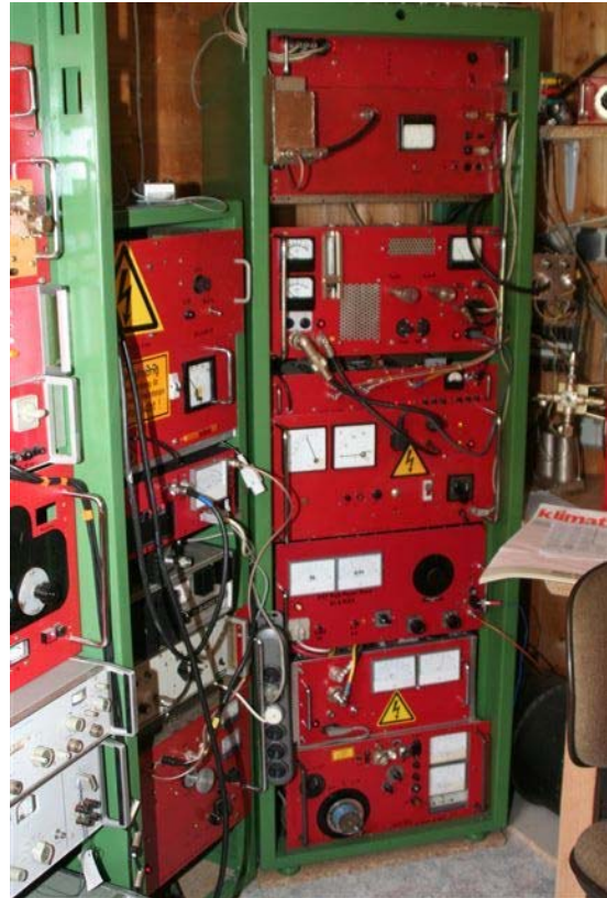
A good occasion was the Czechian- activity morning to bring DQ2006B on 70cm. Here the rack with the amplifiers

We had the problem that out of the weekends there is low activity on 2m and above. The first days we could make some contacts with people who are searching the event- calls, but later on quite often we called and listened without getting any answer. As I am the fortunate- one who sometimes can calculate his job by him self, I spent much time during the day- hours to be present on the band.