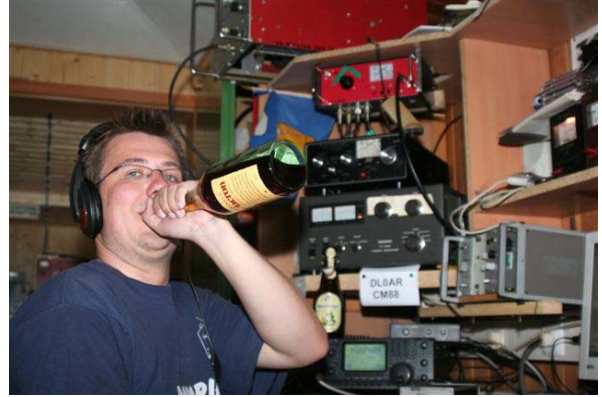
Sometimes there is an interruption necessary

The main activity, of course, was the 2m band, where we could work some good DX. Even some sporadic E openings brought DQ2006B in the VHF- logs from Russian- and Spanish stations!