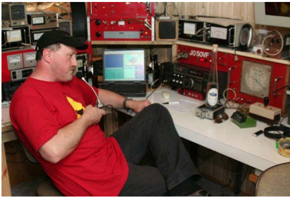
DL6NAA at the 2m radio

The main activity, of course, was the 2m band, where we could work some good DX. Even some sporadic E openings brought DQ2006B in the VHF- logs from Russian- and Spanish stations!