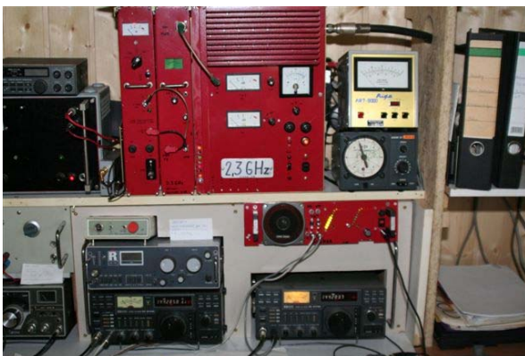
Also few contacts were done on 23 and 13cm