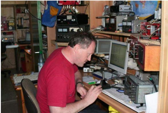
DL6NAA working 10GHz

For some friends a pleasant surprise was our activity on the microwave- bands. During some good "Rain scatter" openings we made really DX on this band.