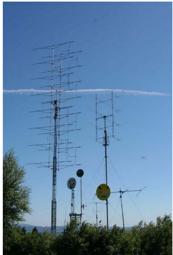
Our complete antenna- farm