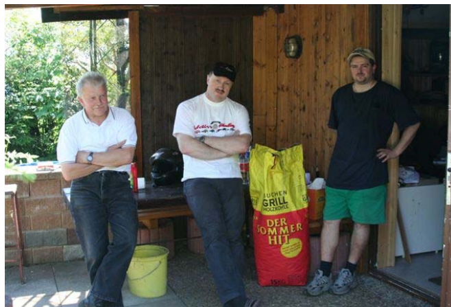
DH1NAS, DL6NAA, DH8NAS discussing important things

So far some infos about two really stressy weeks. I hope you enjoyed them.